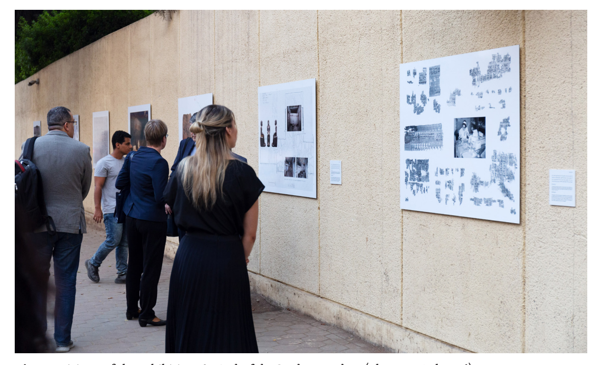
Fig. 2 Visitors of the exhibition The Path of the Czech Egyptology