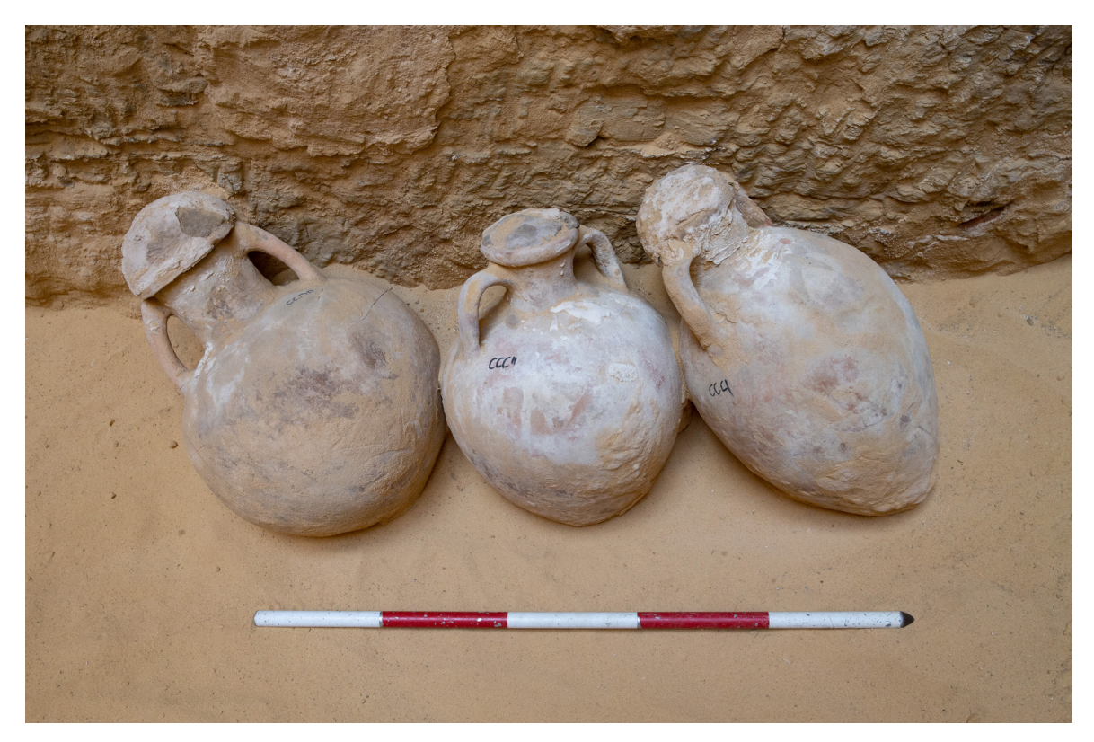
Fig. 6 Greek-style amphorae and Greek imports

red, friable, rich in mica and with a large portion of sand grains) differ considerably from the dense and extremely hard genuine Greek ones (usually fired to brownish colour outer zones and grey core). Only one piece from this assemblage can be attributed to Corinthian provenance (Dupont – Goyon 1992: 153–165, fig. 1/11), while others will be subject to further study and petrographic analysis (fig. 6).