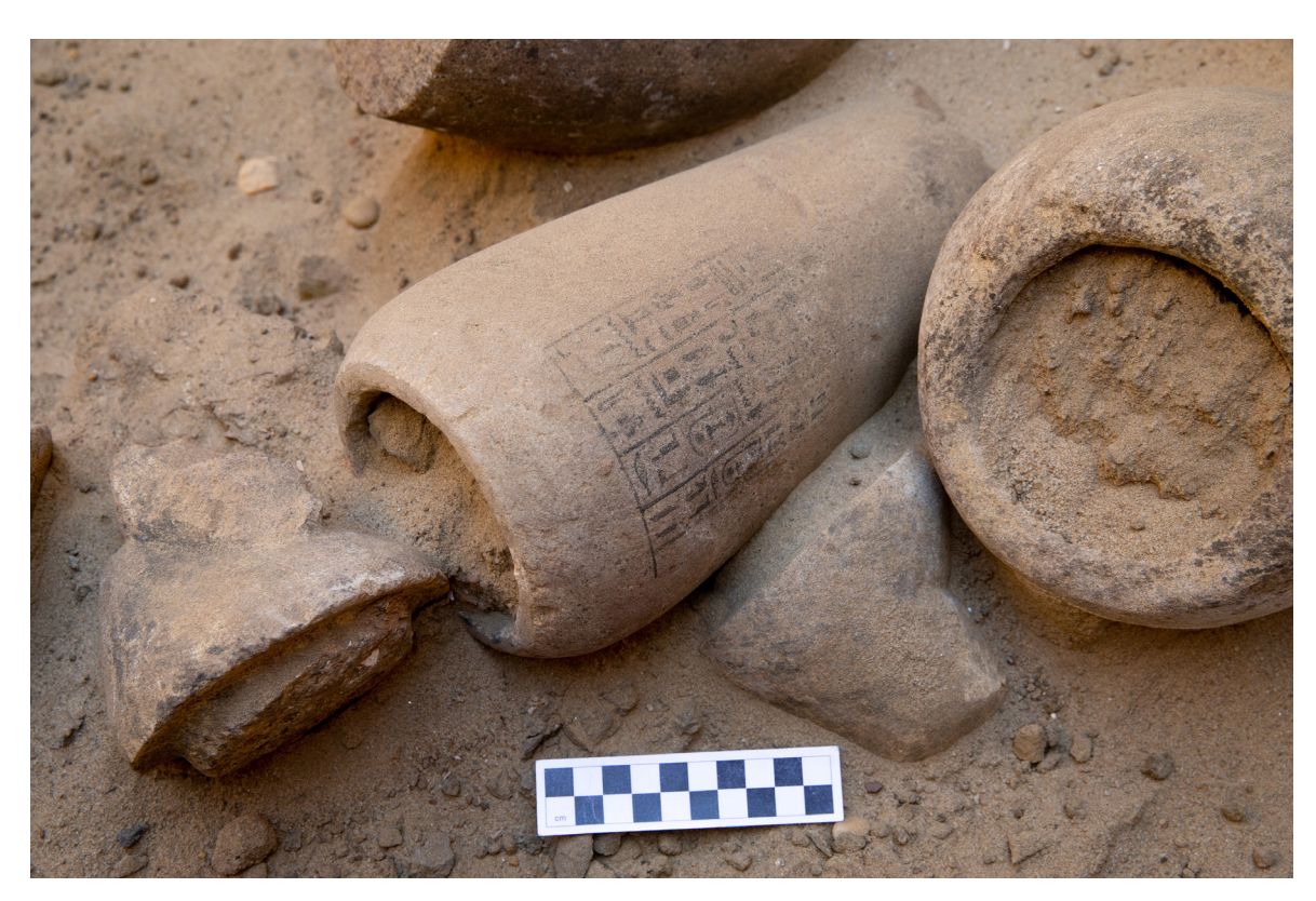
Fig. 9 Limestone canopic jars at the moment of their discovery