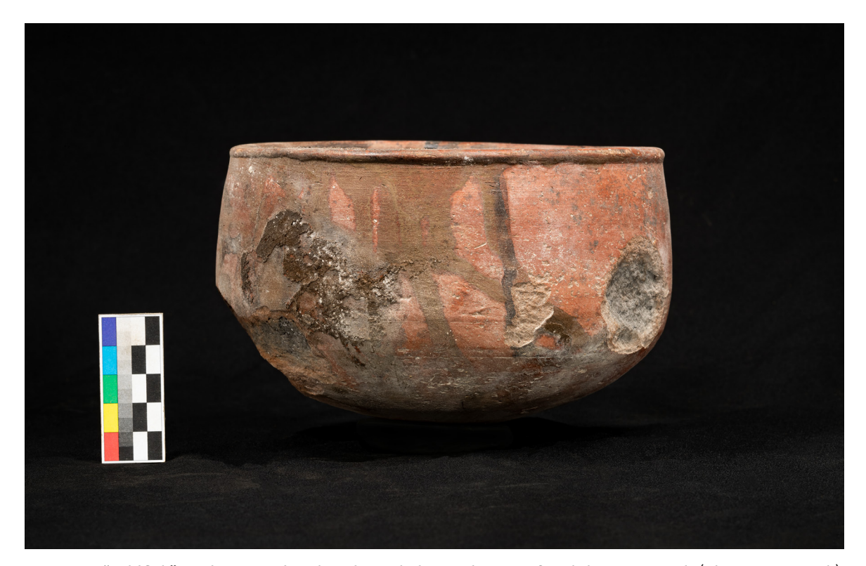
Fig. 4 A "goldfish" jar discovered within the embalming deposit of Wahibremeryneith

From a ceramological point of view, two different types of Egyptian storage jars/amphorae (Smoláriková 2006: 189–196) can be identified. The first type, which clearly predominates, is represented by the large two-handled amphora with a wide mouth and a modelled rim; two massive vertical handles were attached to the shoulders below the rim, and the base was slightly pointed. Those vessels were fabricated of rather fine silt, fired reddish-brown and heavily tempered with straw; their surface was wet-smoothed or coated with red fugitive slip. The second type – more suitable for storage – is represented by the large two-handled amphora with a short, tubular neck, elongated body (very close to the so-called "sausage" type, see Aston – Aston 2010: 212, 61) and rounded base; the surface was smoothed and covered with shallow ridges and two massive handles were attached below the shoulder. Although empty, almost all those amphorae have been sealed with massive plaster or mud stoppers. It is not without interest that quite frequently well-visible remains of fine white linen were identified that adhered to the interior of these amphorae. Certainly, they represent traces of the original contents of the amphorae, used by embalmers during the mummification process. Though only a small portion of the embalming deposit could have been examined so far, it is evident that