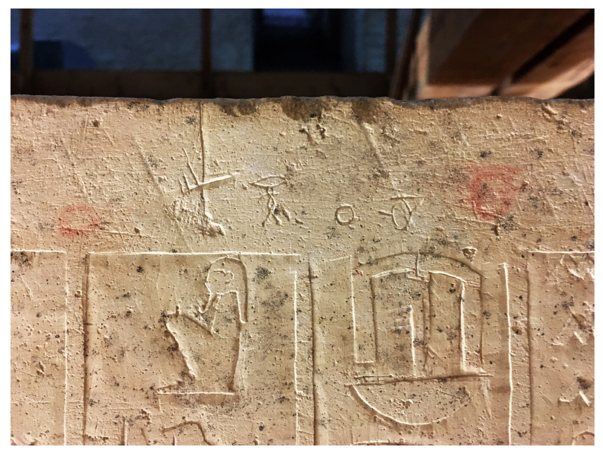
Fig. 11 The name Wahibre carved as well as painted on the outer sarcophagus of Iufaa