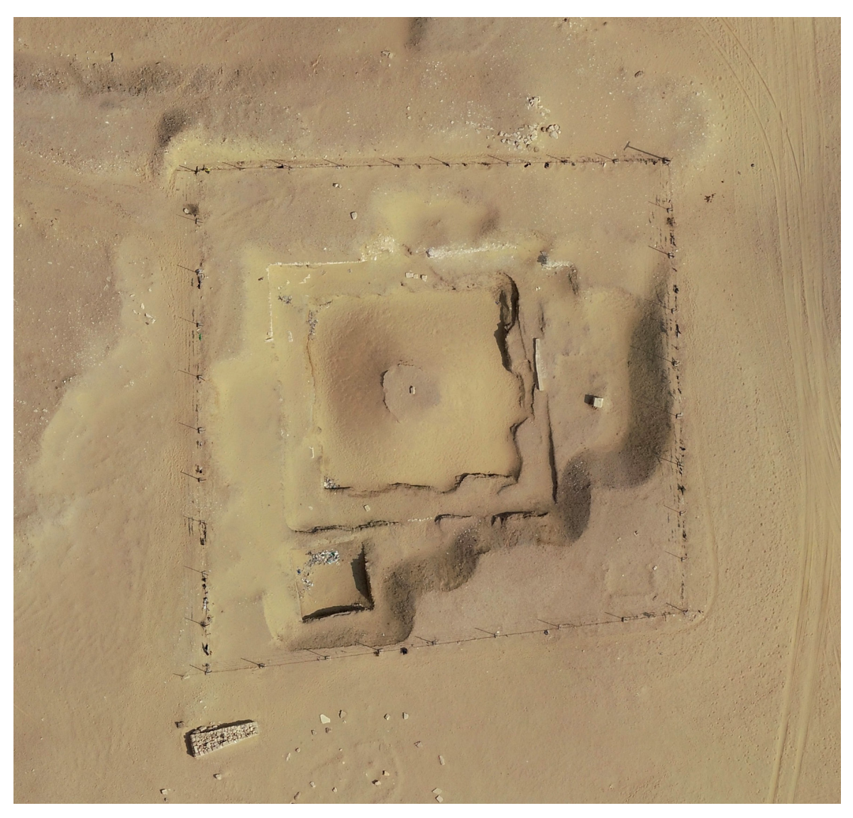
Fig. 2 General view of tomb AW 6 at the end of the excavation season of 2017 (photographed from a kite)

and about 2.2 m thick) built exclusively of white limestone ashlars. Already in antiquity, the enclosure wall has been almost completely destroyed and removed by stone robbers. Because of that, only its foundations have been unearthed, consisting of a levelled ground with only a few limestone blocks remaining in situ. No traces of any relief decoration have been found here or in its nearest vicinity, which leaves us to conclude that, most probably, the superstructure of the tomb has never been completely finished. On the other hand, a massive layer (some 20–35 cm thick), consisting of white limestone fragments, larger and smaller, chips and dust, surrounds the original outer face of the enclosure on all its four sides. Such an amount of white