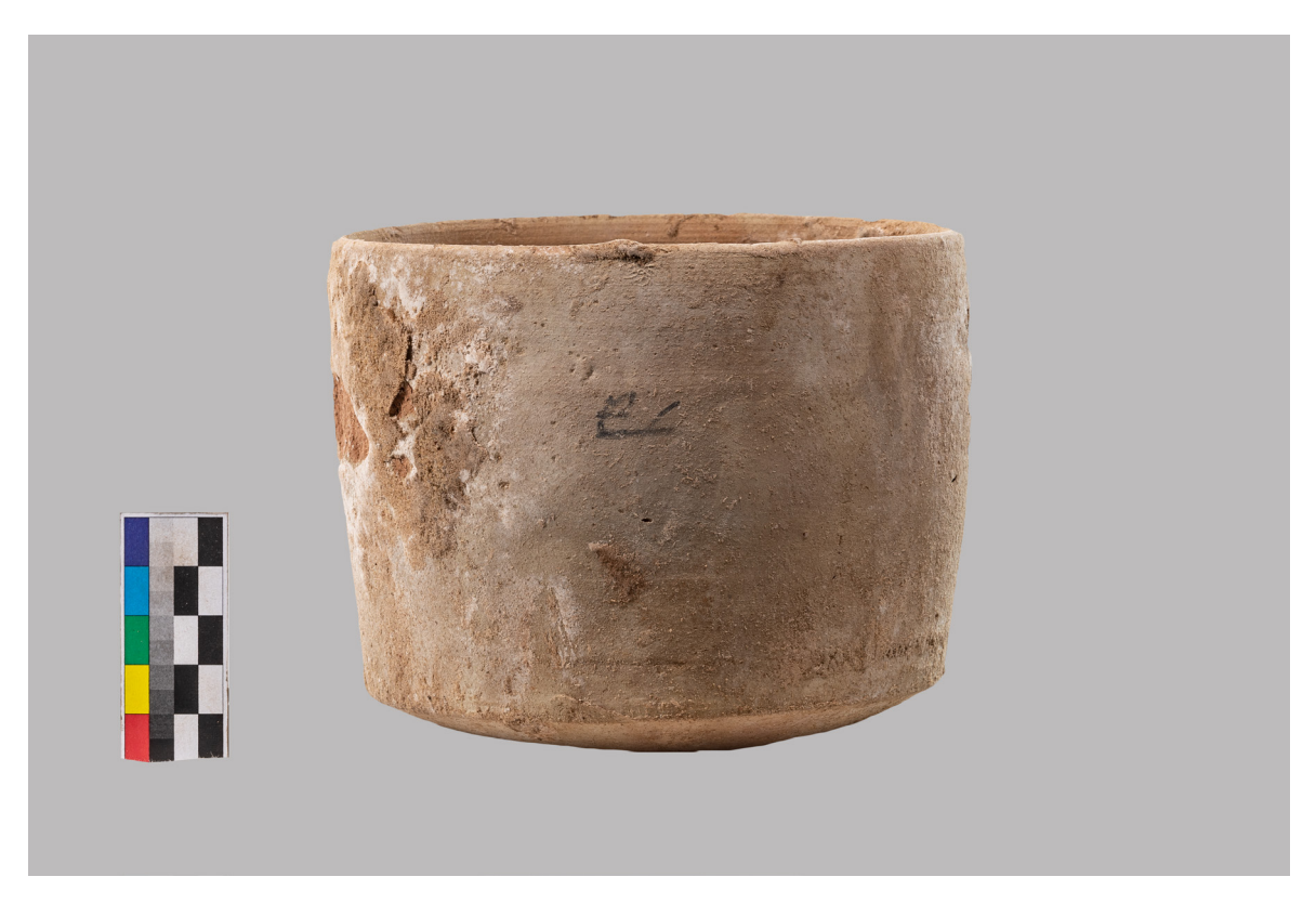
Fig. 5 Marl clay beaker with a short hieratic inscription: rd.w , "efflux"

fragmentarily preserved smaller vessels were often deposited inside these amphorae, which is a phenomenon well-known from numerous other sites across Egypt (Bareš – Smoláriková 2011: 81-99). Most of these smaller vessels were cooking pots or so-called "goldfish" jars of different sizes but almost regularly covered with red fugitive slip (fig. 4; Aston - Aston 2010: 230, plate 24). Curiously, fine drop-shaped jars with fine red slipped burnished surface, so numerous in the embalming deposit of Menekhibnekau buried nearby, were extremely rare (Bareš - Smoláriková 2011: 157); the same is so far true about large bottles with a ribbed neck and fine burnished surface (Bareš - Smoláriková 2011: 153). A bit more numerous were coarse jars with a short rolled rim and slightly pointed or rounded base; their surface was wet-smoothed or self-slipped (Bareš 1999: 91, no. 6). Despite the fact that Nile silt wares were in definite majority, several pieces made of marl clay were also discovered, and surprisingly they were of an excellent quality, as a couple of large fine beakers proved (Aston - Aston 2010: 179–183). They are fired to white with a carefully smoothed surface, their walls are thin and their base is slightly pointed; one of them even bore short hieratic inscription mentioning probably the intended content of the vessel: rd.w, "efflux" (of the body of the deceased; Exc. No. 9/AW 6/2021; fig. 5).