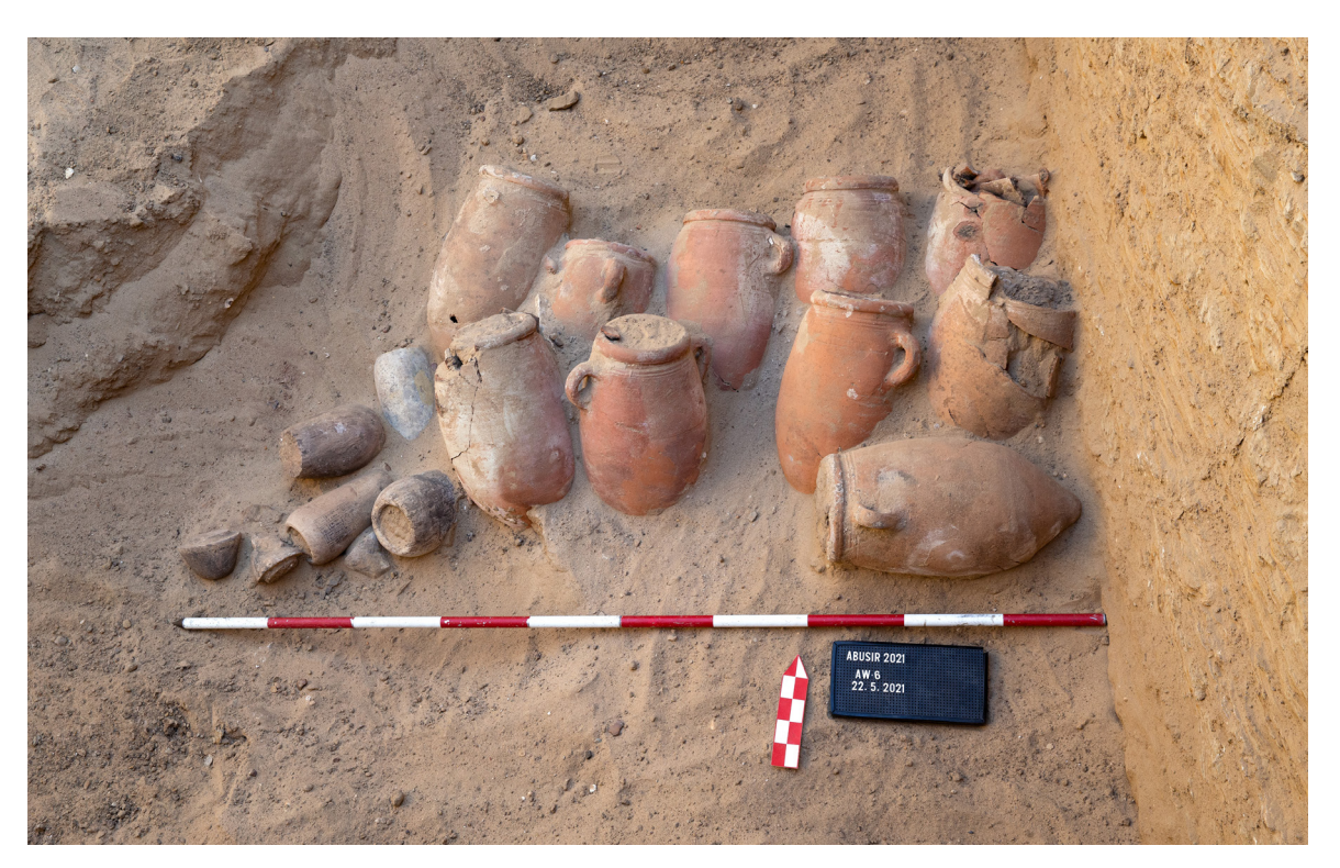
Fig. 3 One of the 14 layers of deposited vessels

In the fill of the smaller shaft situated close to the south-western corner of the enclosure, at depths from 4.4 to 12.1 metres, altogether fourteen clusters of large pottery storage vessels came to light, placed subsequently in different parts of it (in the corners above all) and separated by a layer of sand. The number of jars discovered in these 14 clusters of vessels (storage jars) varied considerably from 7 to even 52 pieces (fig. 3). In total, more than 370 large storage