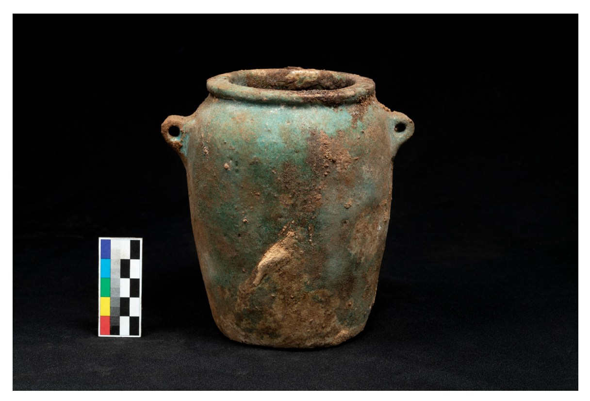
Fig. 7 Faience cups in the shape of ib (heart)