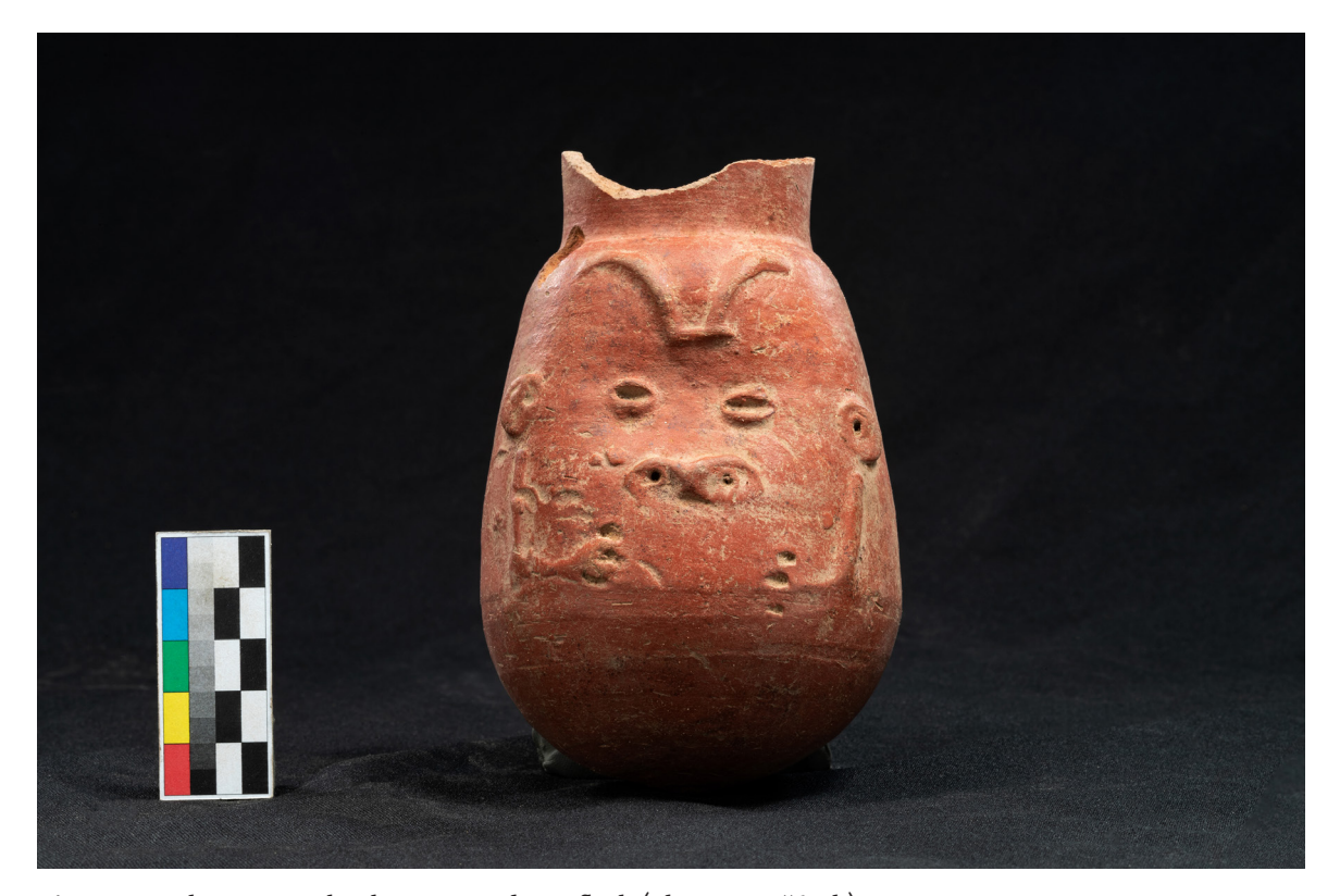
Fig. 8 An almost completely preserved Bes-flask