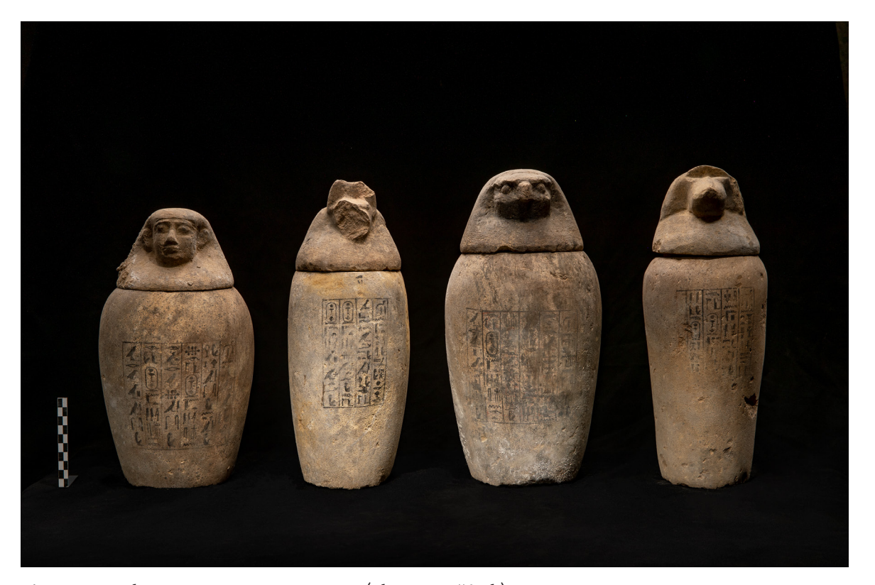
Fig. 10 Four limestone empty canopic jars