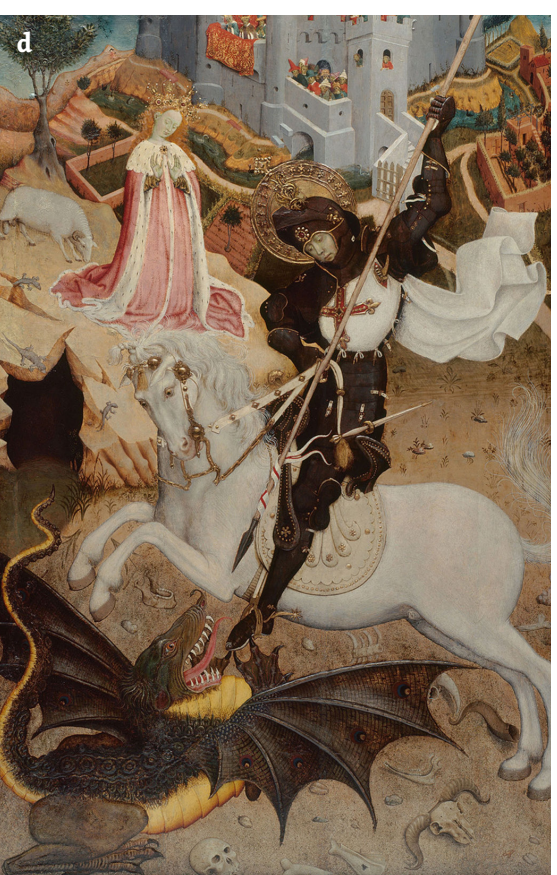
Fig. 4 Horus and Seth, saint and Satanic dragon. (a) Horus standing on a boat and spearing Seth in the form of a hippopotamus, Ptolemaic wall relief, Temple of Edfu (photo Lloyd D. Graham, 2020) (b) Detail of the Seth-hippopotamus from bottom left of panel a. (c) Horus on horseback spearing Seth as a crocodile, Fourth Century AD, sandstone window fragment, Louvre E 4850 (photo Rama, via Wikimedia Commons, Creative Commons BY-SA 3.0 FR, online at https://commons.wikimedia.org/wiki/File:Horus_horseman-E_4850-IMG_4871-gradient.jpg) (d) Saint George killing the dragon, Bernat Martorell, ca. 1434 AD, tempera on panel, Art Institute of Chicago 1933.786. (Image Public Domain, via Wikimedia Commons, online at https://commons.wikimedia.org/wiki/File:Bernat_Martorell_-_Saint_George_Killing_the_Dragon_-_Google_Art_Project.jpg; panel (d) has been flipped horizontally for maximum compatibility with the other panels.)