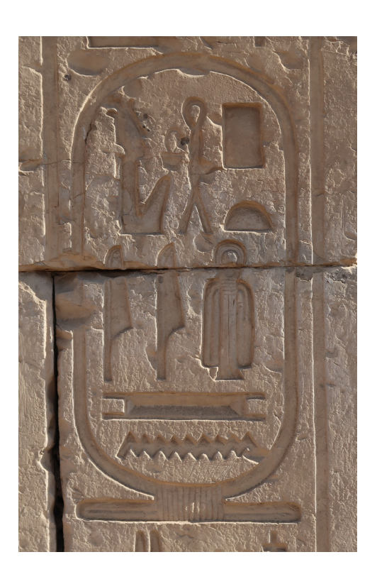
Fig. 3 A cartouche of Seti I in the precinct of his memorial temple at Abydos. The orthography, which uses the Osiris and knot of Isis glyphs in place of the Seth glyph, renders the king's name cryptographically as S(w)t.y

Histories V: 5; Cannuyer 2017: 28). A further Sethian association for the Jewish deity can be found in the fact that Iaw, the rendering of YHWH in Greco-Egyptian texts, was phonetically similar to the Egyptian and Coptic words for donkey, 3 and \varepsilon Iw, respectively, which in turn reflect the sound of an ass braying (Assmann 1997: 37; Cannuyer 2017: 29). The Iaw of Greco-Egyptian magical texts features in Coptic Gnostic texts as IaO (IAO), an Archon who represents or assists the jealous and ignorant demiurge Ialdabaoth, who is himself a negative recasting of YHWH (Cannuyer 2017: 34; Rasimus 2009: 104–105; Turner 2019: 151). Magical and Gnostic text genres are discussed in detail below (see: Magical Seth, Gnostic Seth).