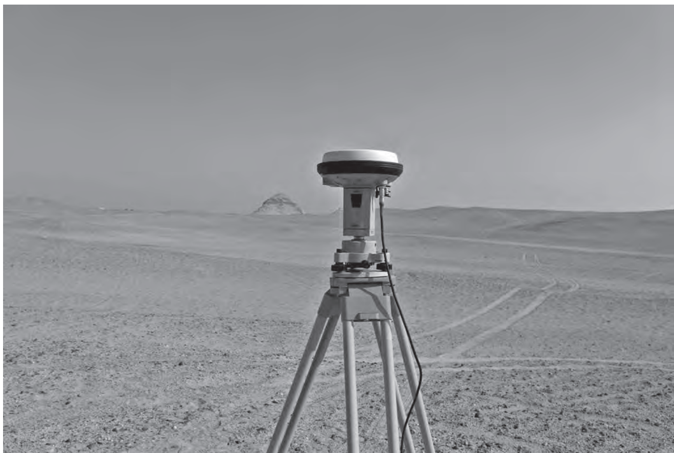
Fig. 1 Global navigation satellite system (GNSS) receiver in the field